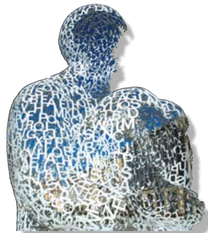
Artist Juame Plensa's Nomade is a giant sitting man made of steel letters that will be part of the Pappajohn Sculpture Garden in Western Gateway Park.

Western Gateway Park is home to the Des Moines Arts Festival. The Festival includes emerging Iowa artists, the Interrobang Film Festival, professional juried artists, street theater and other art activities.